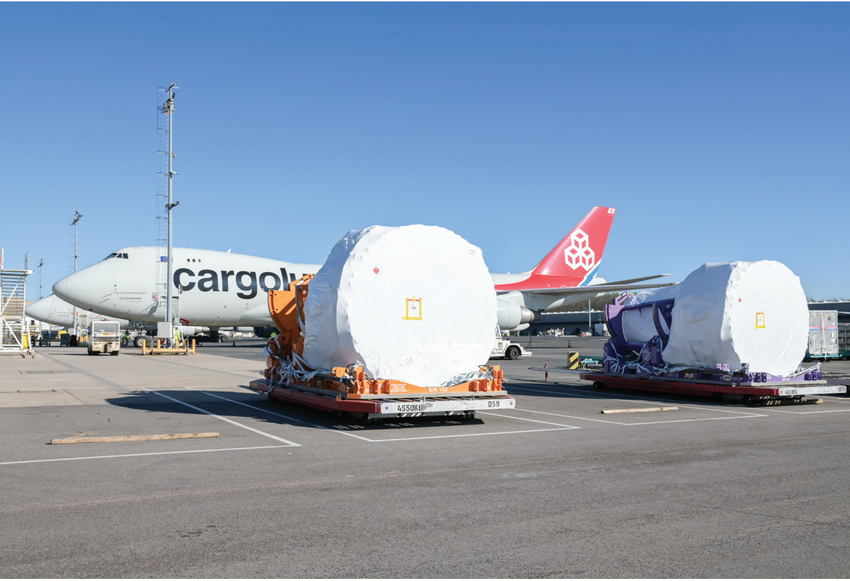
Charlie Victor — The PRODUCTS issue — DISCOVER

WITH OVER 55 YEARS OF EXPERIENCE IN THE INDUSTRY, CARGOLUX HAS DEVELOPED EXTENSIVE KNOW-HOW IN THE COMPLEX WORLD OF AIR CARGO.